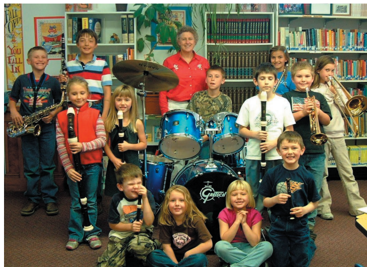
FIELD STUDY SUPPORT

The music program continues to grow and expand, and in turn, expanding our students education and enriching their lives. For more information on the, go to http://www.snowmanfoundation.org or http://www.frenchgleneducationfoundation.org for more information on the Frenchglen Education Foundation.